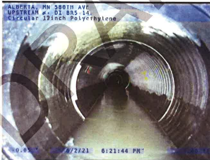
Figure 3: No Sand

UPSTREAM-DI BR5-14_622021 63020 PM_0.0000_MWL_0347.jpg, 00:01:04, 0.00ft Water Level, 10% of the vertical dimension / 12%